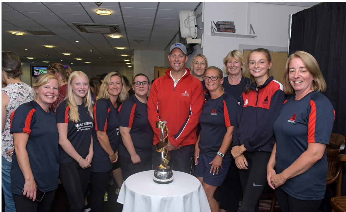
Paignton Ladies pictured with Marcus Trescothick at Somerset County Ground for a special ladies day

From a softball perspective we had 20 ladies signed up for Wine and Wickets this year. We hosted