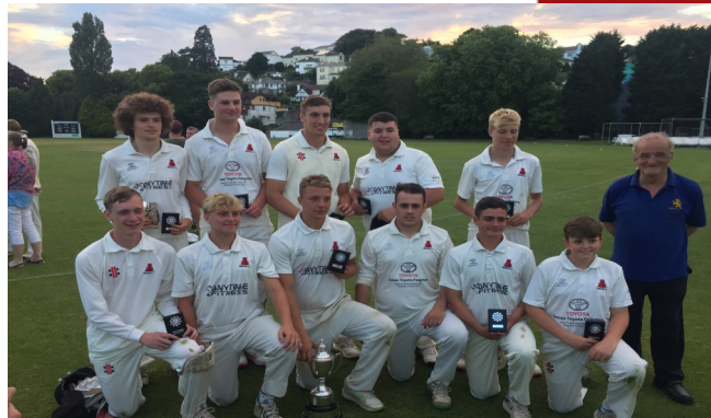
Aaron Printers Cup winning Team