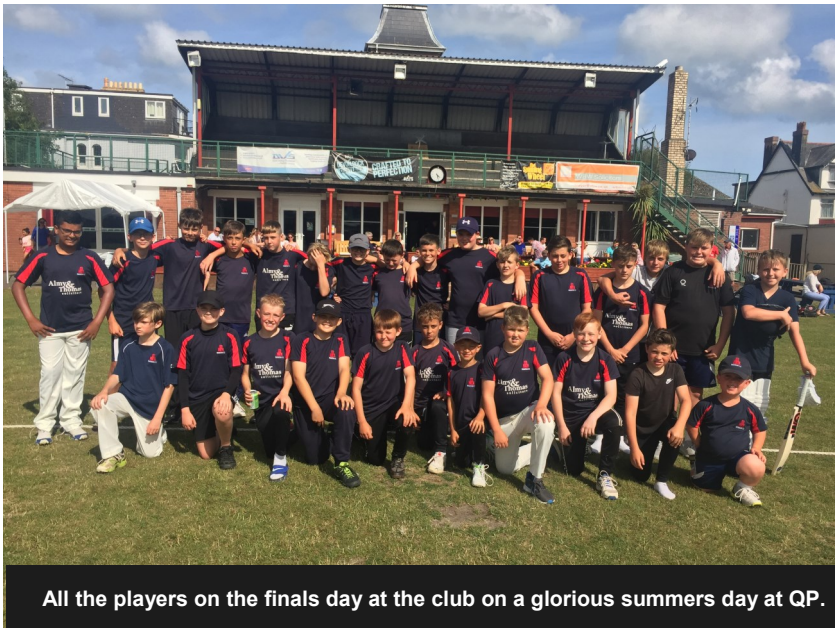
All the players on the finals day at the club on a glorious summers day at QP.

2019 was another great season for our Youth set up, but if we wish to keep developing as a club we can't afford to sit on our laurels.