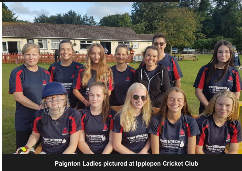
Paignton Ladies pictured at Ipplepen Cricket Club