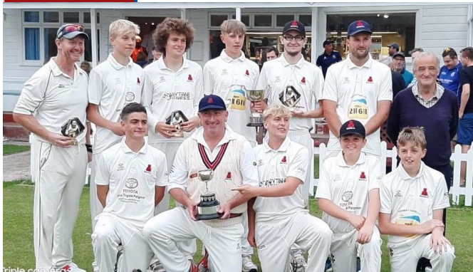
Brockman Cup winning Team